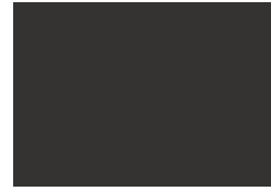
ANTIQUÉ BRONZE (DARK BRONZE)