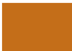
COPPER PENNY (METALLIC COPPER)