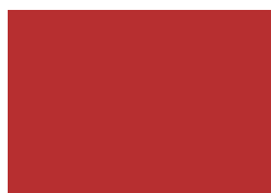
CARDINAL RED* (BRILLIANCE RED)