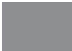
SILVER (BRIGHT SILVER)