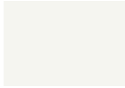
BONE WHITE (REGAL WHITE)