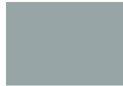
CITYSCAPE (DOVE GRAY)